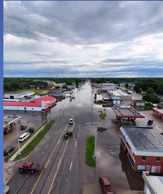
Spencer Flooding June 2024