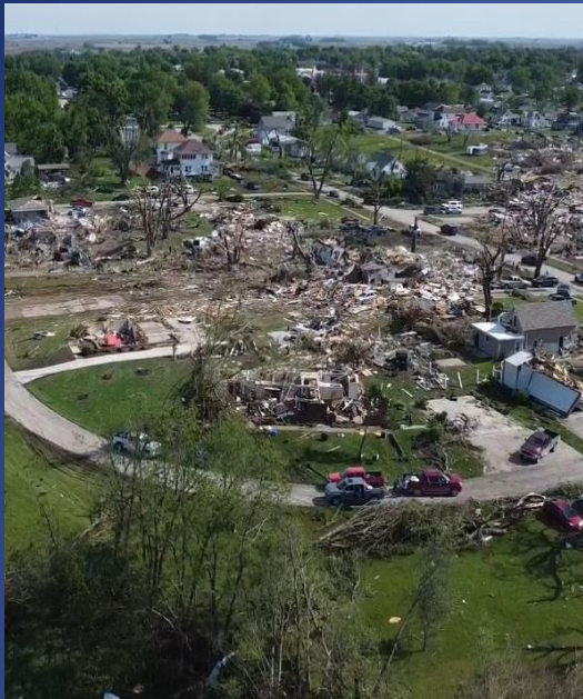
Greenfield Tornado aftermath May 2024